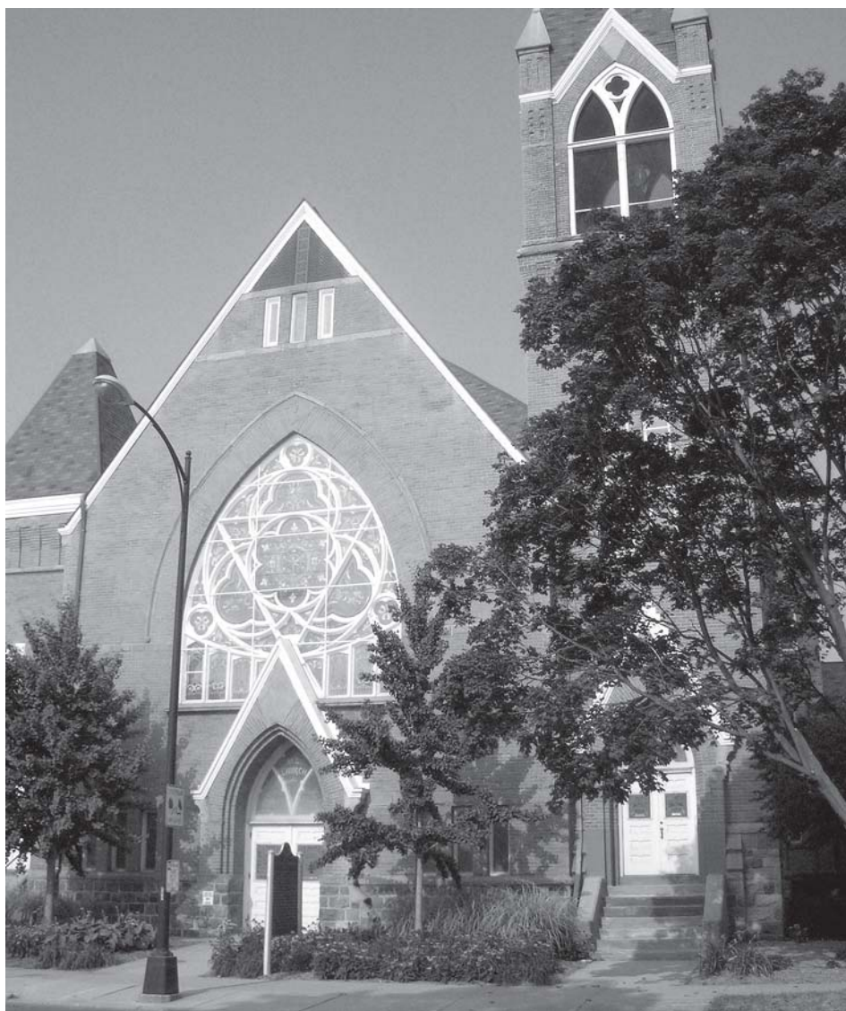
2005 - First United Methodist Church.