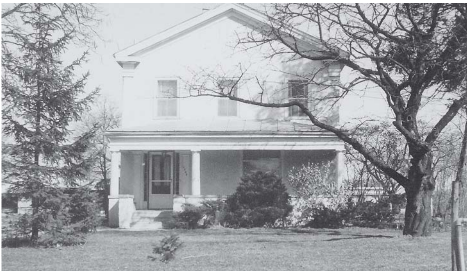
Starkweather farmhouse at 1266 Huron River Drive

The possibility that the Starkweather House at 1266 Huron River Drive might be demolished became evident during the summer of 2003. The Ypsilanti City Council appointed a Historic District