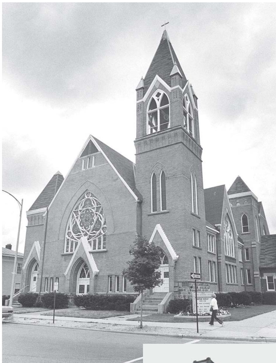
Above: 1892 – Church Constructed at a Cost of $32,000.

In 1839, the Ladies Sewing Circle was organized, the object of which was to “clothe the poor children and get them into Sunday School and any other Benevolence that came their way.” This was the beginnings of what would eventually become the United Methodist Women’s organization, a group that continues to impact the church and its mission today.