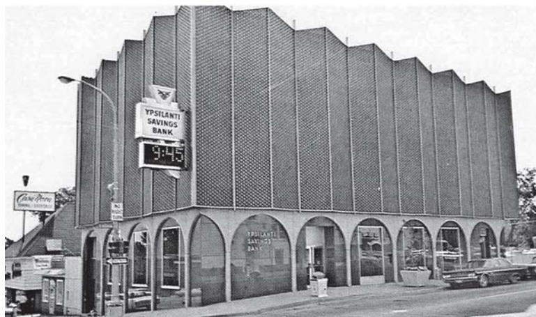
Aluminum paneling installed on street sides of building in 1966-67.