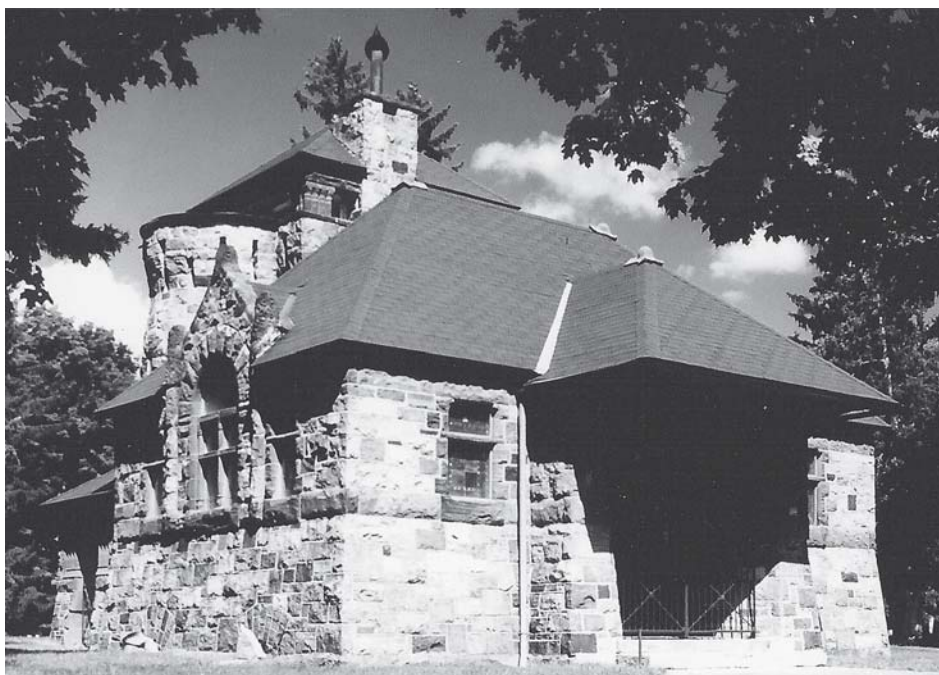
Starkweather Chapel in Highland Cemetery.

The historic preservation movement and interest in genealogy have brought fre-