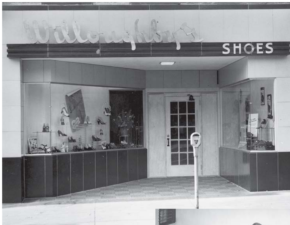
Above: Display windows in the Willoughby shoe store.

Dad's father opened a general store outside of Capac. From this store, he and his brothers were very familiar with operating a business. Dad's brother moved to Plymouth and opened a retail store. Dad served in the Navy during World War I. After returning from overseas, he received fi-