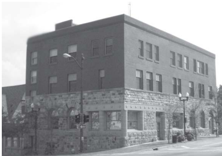
Building as it exists in 2005.