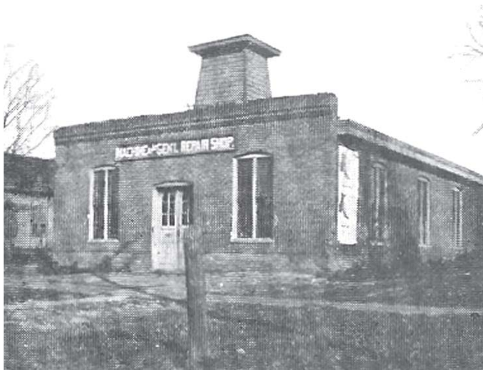
1835 – Chapel on River Street.

Condensed from Histories of Methodism in Ypsilanti