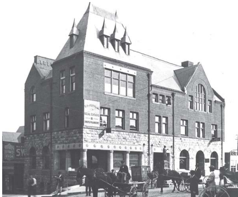
Structure built in 1877 at a cost of $20,000.

In the 1940s the top floor and steep roof were removed and in 1966-67 aluminum paneling was installed on the two street sides of the building. The paneling gave the building a modern look but the style continued on page 13